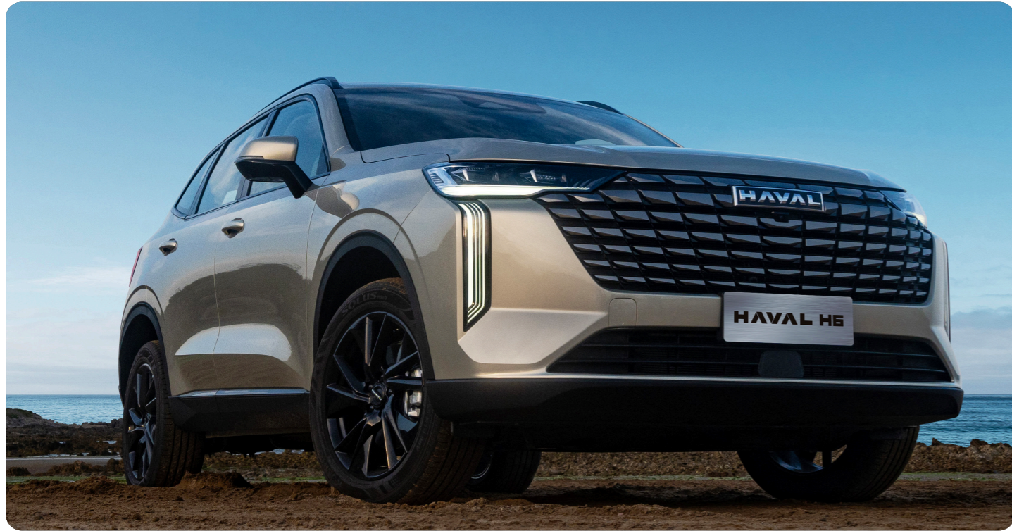
Model-dependent features mentioned. Please consult the specifications section from page 28.